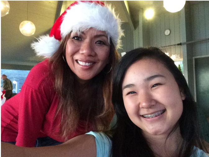
Our Selfie specialist