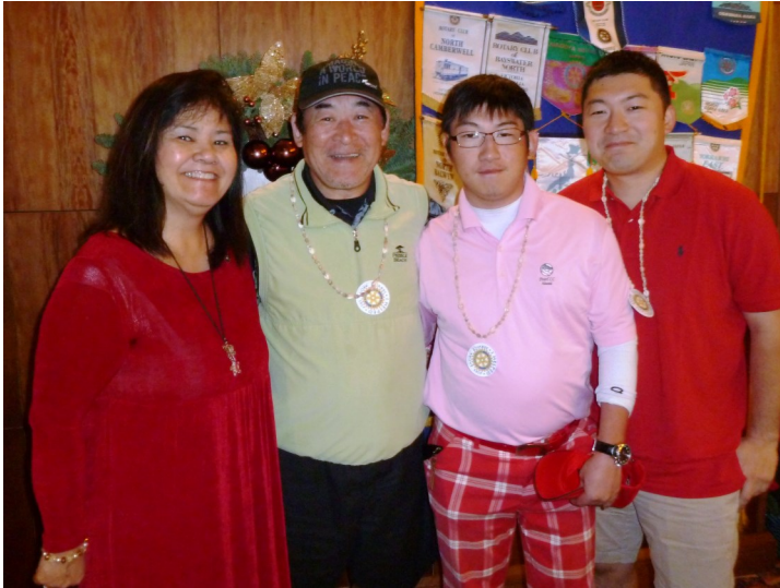
Visitors from Kyoto Japan